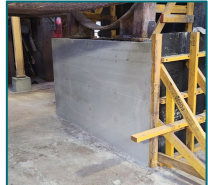
Figure 5: Progression images of concrete remediation work undertaken.