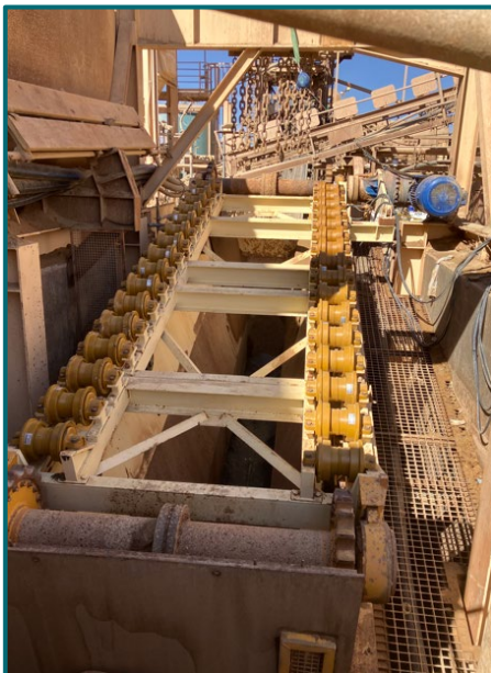
Figure 3: Apron feeder, fitting of new rollers.