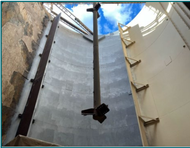
Figure 1: Tank 0 north wall progression image of abrasive blast cleaning in preparation for painting.