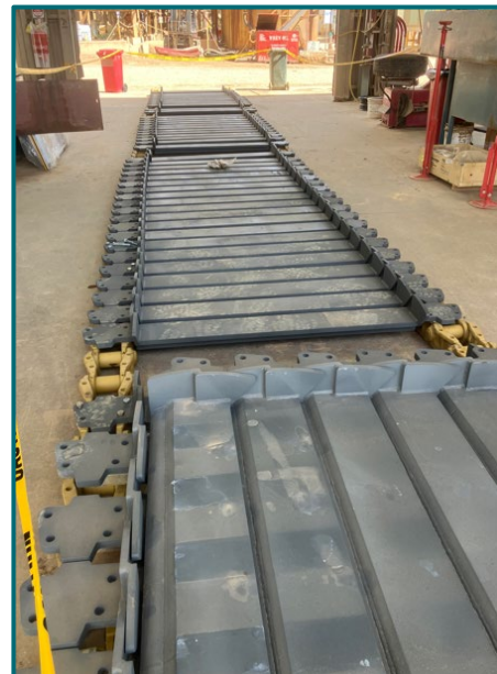
Figure 4: Apron feeder, new chains and pans.